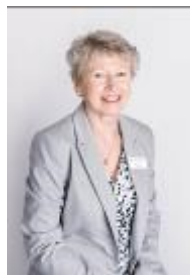
CHRISTA Direct Care Services