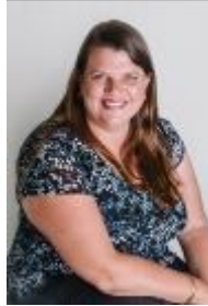
CORALIE Carer Support