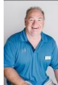
BRENT Carer Support