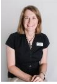
VICKI Chief Executive Officer (CEO)