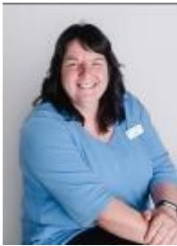
GABY Carer Support