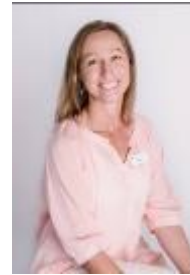
MARION Direct Care Services