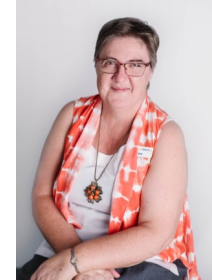
PAM Young Carer Support