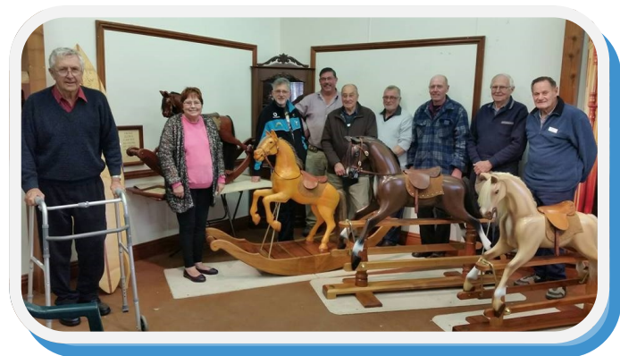
Above a recent outing to a Woodcarving business.

"We laugh and share our stories, and the food is good too!"