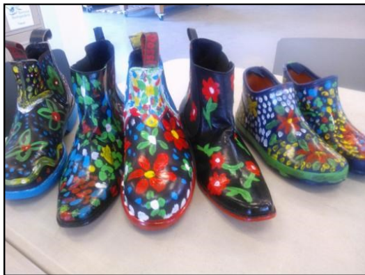
Gumboot Planters created by the group