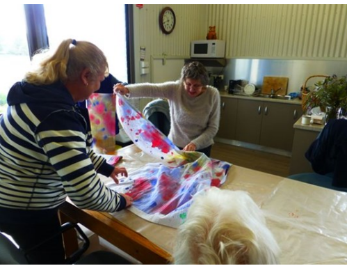
making silk scarfs

If you would like to attend this program please call 'Carers and Disability Link' or contact the 'My Aged Care' contact centre on 1800 200 422 or website www.myagedcare.gov.au . Request a referral to the 'Carers and Disability Link, Barossa - Centre Based Respite Program'. For assistance with a 'My Aged Care' referral please call our office on 8562 4000.