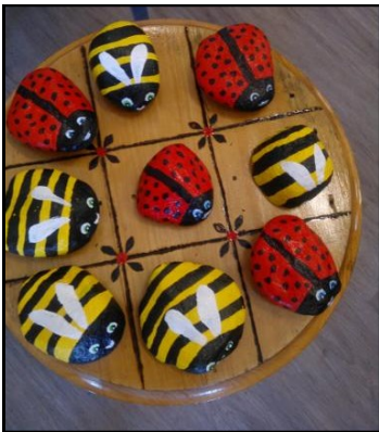
Insect Board Game created during the program with hand painted stones.